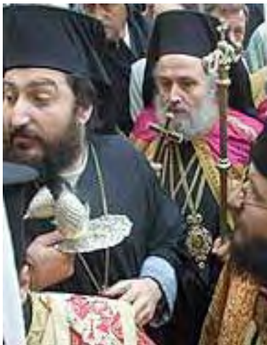
A procession of Greek orthodox churchmen makes their way through present-day Jerusalem.