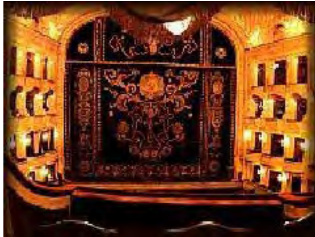
The grand proscenium of the Odessa Opera House, with private balcony boxes on both side walls.

But let me beg you to take this simple message to Jesus is crying out in grief. He is waiting for you to act. May Jesus plant his seed of love within every man and woman of good will!"