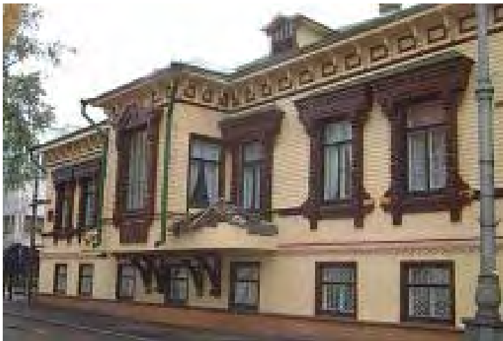
The restored villa of a 19 th -Century German merchant in present-day Archangelsk.