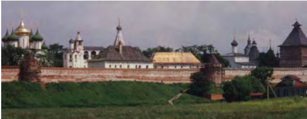
A view of the Susdal Monastery from outside the perimeter walls.

Tears were shed in Archangelsk when word of his banishment reached those who loved him. For his parents, the news was a mortal blow. Three months later his mother died of grief, and soon afterward his embittered father, who made repeated unsuccessful petitions on his son's behalf, gave up and died of a broken heart too.