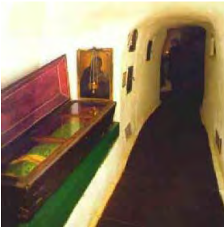
A passage in the Caves of Lavra, where entombed saints still draw throngs of tourists and pilgrims.