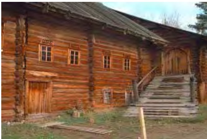
A 19 th -century cabin in a village outside Kiev.

The woman brought Rachoff into a nearby house, and there he found an old man with swollen feet, lying near a brick stove with