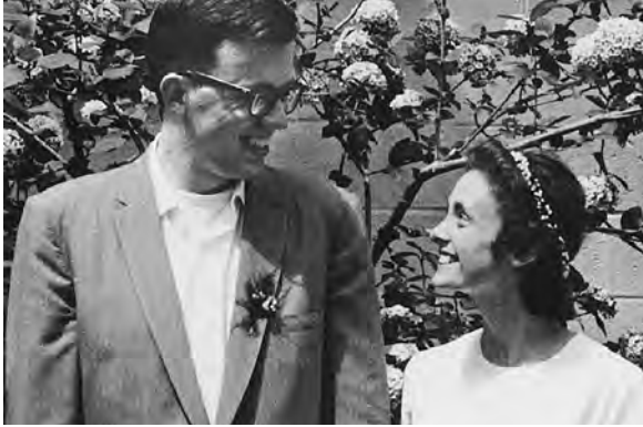
The author and his wife on their wedding day

and play with me, so we often ended up romping in the garden. Afterwards, Verena had to clean up the children all over again, which she did, though not without a little justified grumbling.