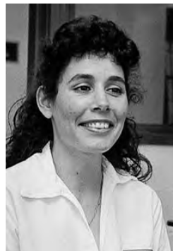
Karla Faye Tucker